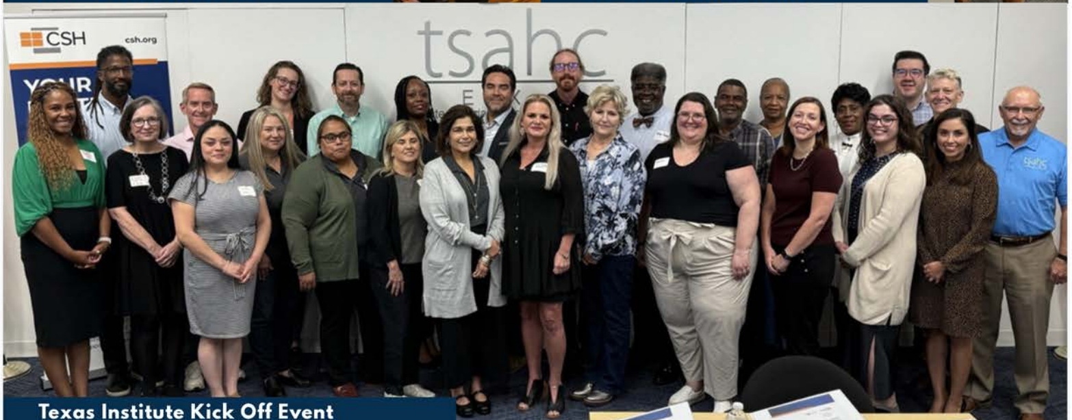
Texas Institute Kick Off Event