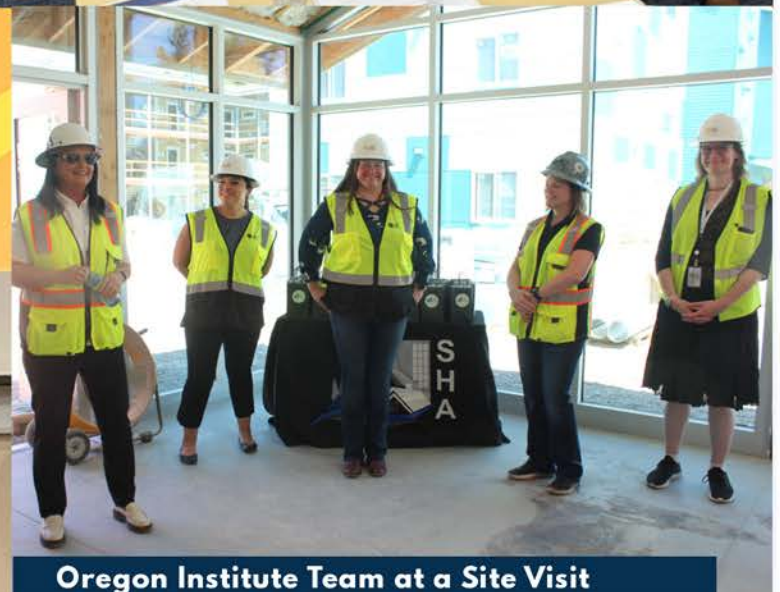
Oregon Institute Team at a Site Visit