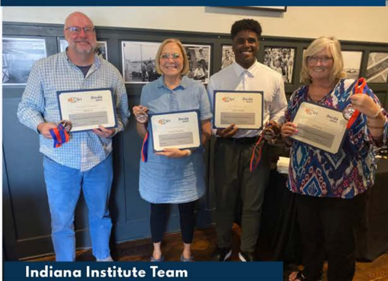
Indiana Institute Team