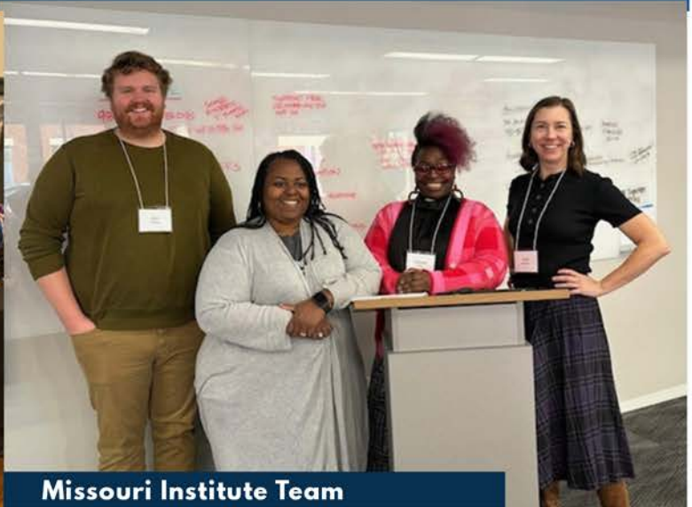
Missouri Institute Team