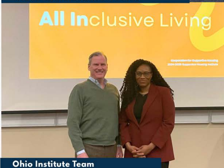
Ohio Institute Team