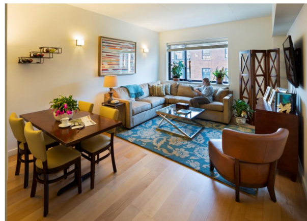
Photo Images of Hour Apartment House III , supportive housing in Astoria, NY. The property is one of 7 owned and operated by Hour Children Inc. , an organization dedicated to providing comprehensive help for the women and their families to build new lives together post-incarceration.